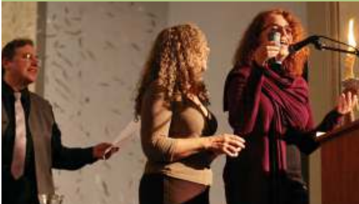
Our musical prayer leaders open The Buddha & the Ba'al Shem Tov with song.